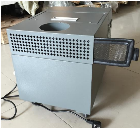
air inlet filter to avoid the dirty dust