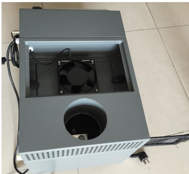
Separate top fan, very reasonable