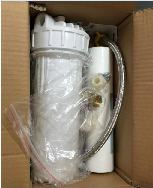
accessories box includes the filter, water pipe,screw, valve etc. This accessories box will be together with each humidifier.