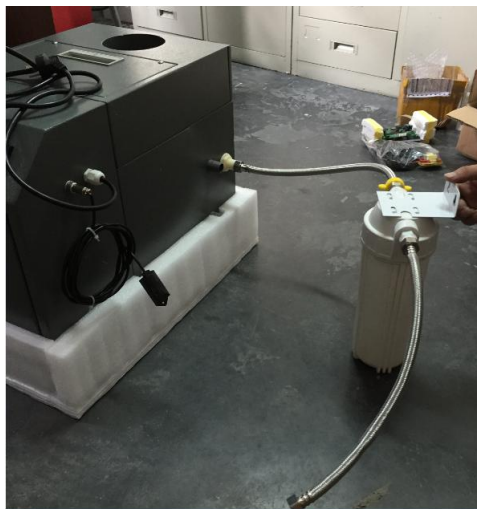
connecting with the filter. There has the metal plate could fix the filter onto the wall.