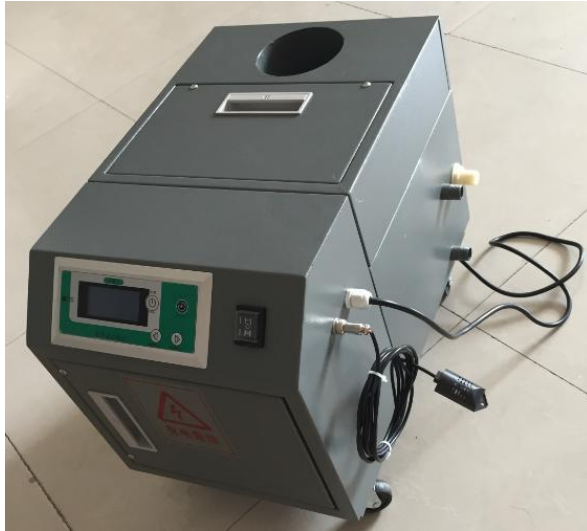
with outer water sensor